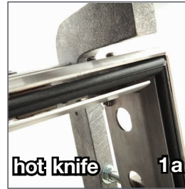
hot knife 1a